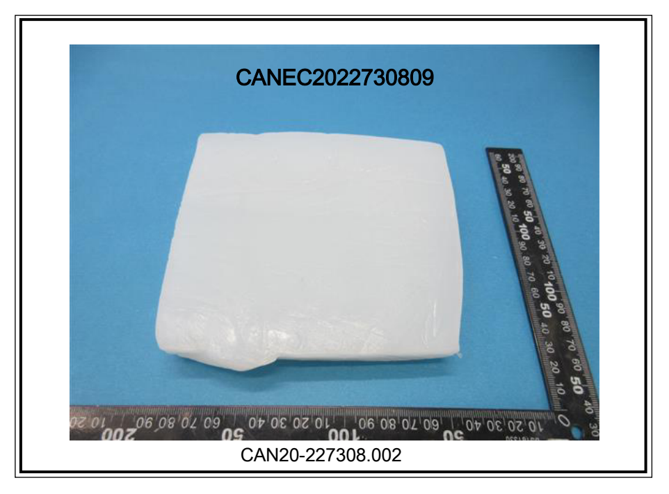
SGS authenticate the photo on original report only